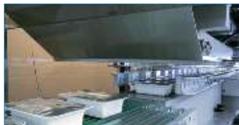
4. A tray sealing machine from Inauen seals the filled plastic trays with an aluminum foil.