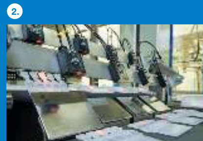
2. Each individual strip is read (2-D matrix code) and rejected if necessary.