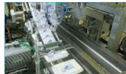
5. A Pago labeling system integrated in the TLM marks labels and dispenses them onto the tray lids. The lids are positioned by a Schubert TLM transport system.