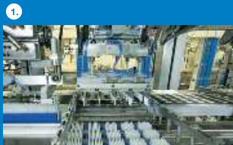
1. The product carriers fed in offline are unloaded with Schubert system components and transferred individually to a product belt.