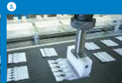
3. Four TLM-F44 systems detect the products and place them top to toe in the primary packaging.