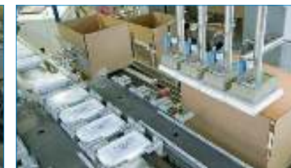
6. The primary packaging (tray or carton) is packaged with flexible TLM technology in American folding cases or, as an alternative, in cardboard trays.